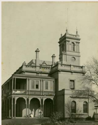
First School Building - Holtermann's 1889