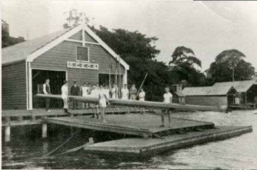
Eric Russell Sinclair Memorial Boatshed 1919