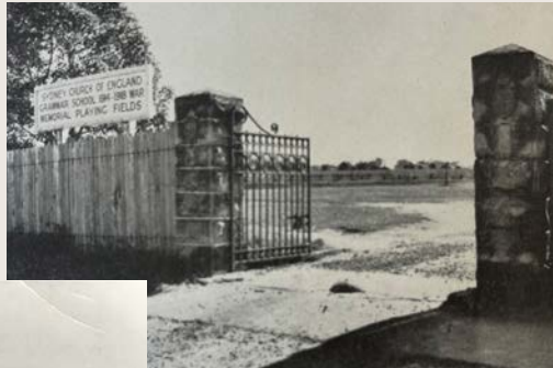
War Memorial Playing Fields 1919