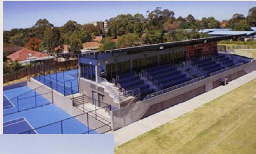
Northbridge Pavilion 2013