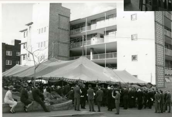
Benefactors Building 1964