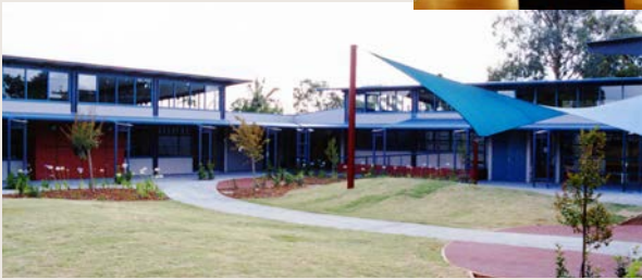
WA Purves Centre 2003