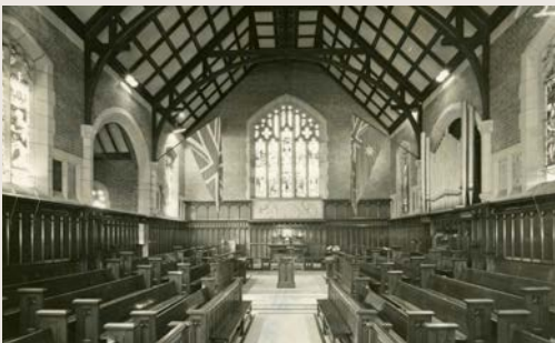
Shore Chapel 1915