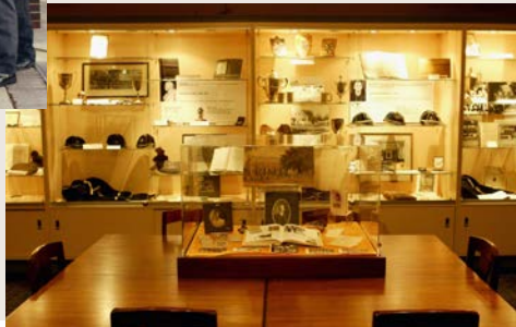
Bob Gowing Museum 2001