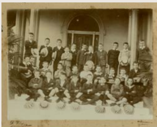
Boarding students c.1900