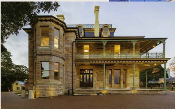
Graythwaite opened 2014