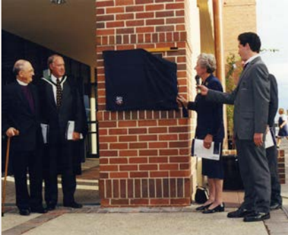
BH Travers Centre opening 2000