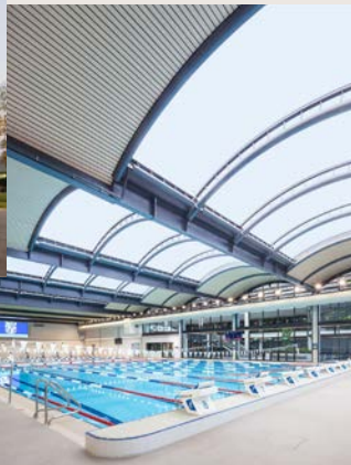
R A I Grant Centre 2020