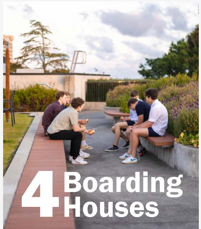
1889 School House, 1926 Robson House, 1930 Hodges House, 1939 Barry House

We teach, model, and encourage service through various opportunities. Service is something to be both taught and caught; students learn by example and through direct participation.