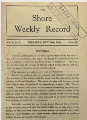
First Shore Weekly Record 1939